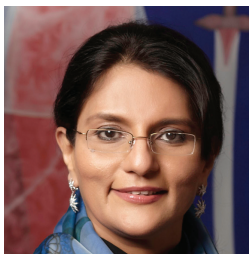
PREETHA REDDY Vice-Chair Apollo Hospitals Group